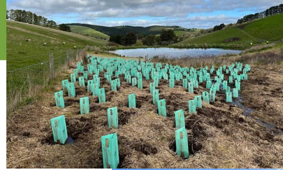
The A2 Milk Company