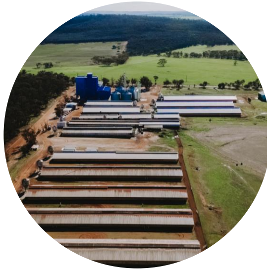
Renewable energy sources