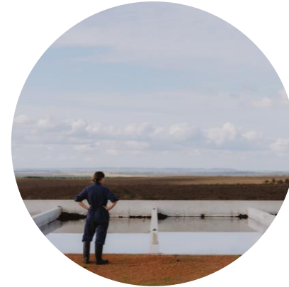
Waste water recycling