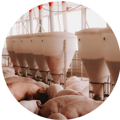
Approved food waste for feed